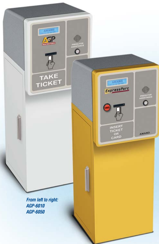
From left to right: AGP-6010 AGP-6050

The AGP-6000 Series Exit Station is designed for multiple uses, typically at the unattended exits of a parking facility. The AGP-6010 Series Exit Station accepts paid parking tickets, and confirms the patron has paid and exited within the programmed lag-time. The AGP-6050 Series adds credit card / mag-stripe access card functionality for ticket in/credit card out, and credit card in/credit card out when used with the AGP-2050 series Entry Station and on-line credit card host software.